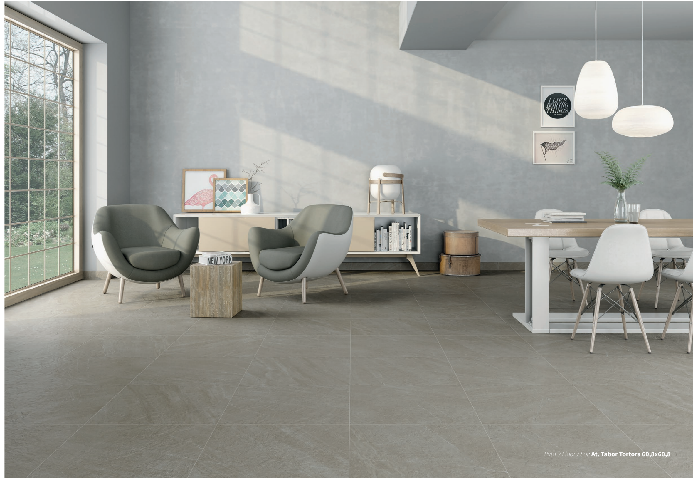
Pvto. / Floor / Sol: At. Tabor Tortora 60,8x60,8